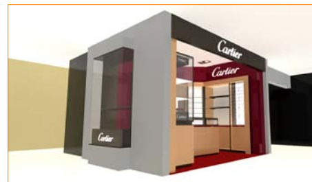
Customized Side Window