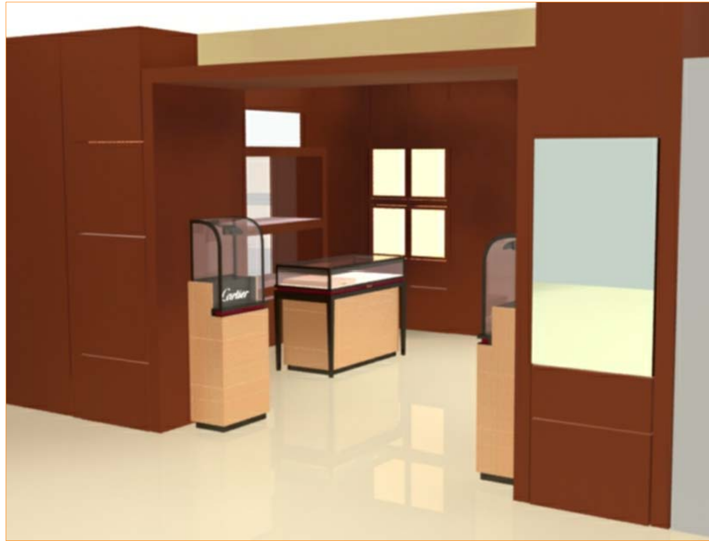
Cartier High Watch Making - Joyeria Daoro CCS, Venezuela