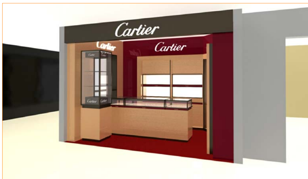
Espace Cartier El Dorado Int' Airport - Bogota, Colombia