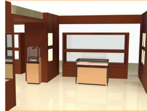
HWM Counter and Cloches