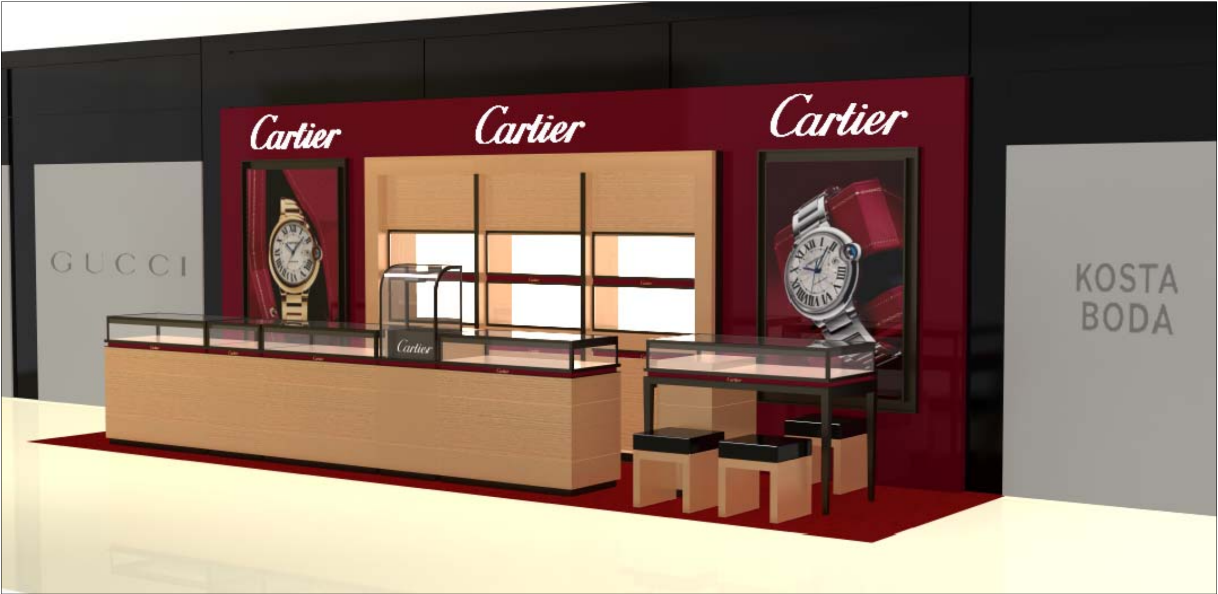
Espace Cartier BARED - Pavillion Limoge San Juan, PR